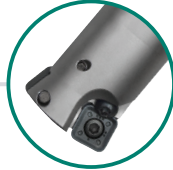
END MILLS 1 1/4" - 1 1/2"