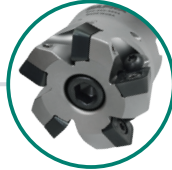
SHELL MILLS 2" - 6"