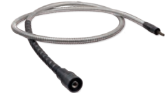
DV7 Flex 030 190 801