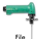
File FR5-827 - 020 000 730