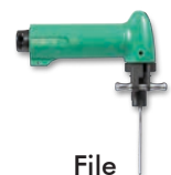
File FR5-827 - 020 000 730