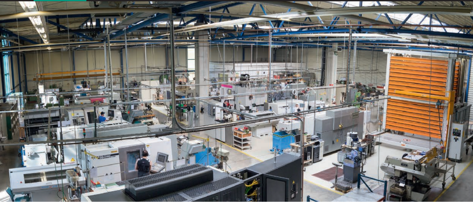
Production hall at the Maulbronn factory