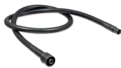
DV6 Flex 032 004 600