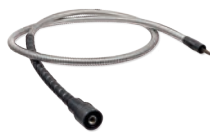
DV7 Flex 030 190 801